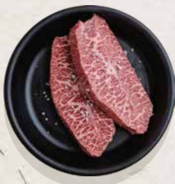
Wagyu Oyster Blade 와규낙엽살 | 150g 37