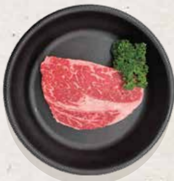
Wagyu Cube Roll 와규꽃등심 | 200g 49