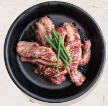
Marinated Wagyu Rib Finger 양념갈비살 | 250g 32