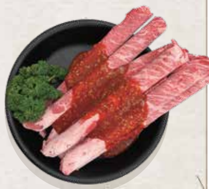
Sliced Chuck Eye Roll [ Soy / Spicy ] 숯불와규불고기 | 200g 29