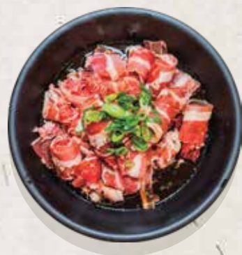
Marinated Sliced Pork