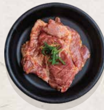
Marinated Pork Collar Butt